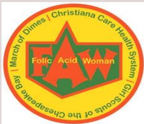
THE NEW FOLIC ACID WOMAN PATCH!